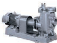
Centrifugal self-priming pumps FS, GS Series