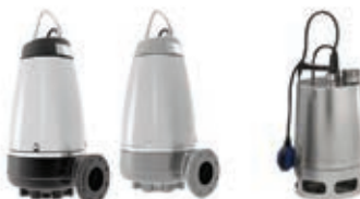
Submersible sewage pumps Unilift, DP, DPK, SE, SL Series