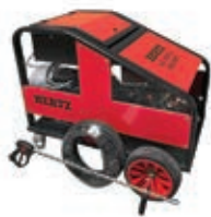
Electric high pressure cleaners and accessories

Your most reliable brand of robust solutions for the marine industry