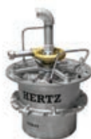
Water / Pneumatic gas freeing fan