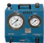
High pressure pump unit