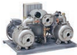
Commercial booster sets KB, KF Series