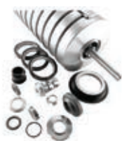
Genuine Grundfos Spare Parts