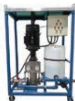
Hold cleaning pump HPV-25A