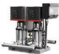
Booster sets Hydro Multi Series