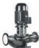
Vertical inline centrifugal pumps