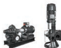
Split case pumps LS, LSV Series