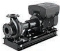
Horizontal end-suction pumps NB, NK, NKG, NBGE Series

Authorised dealer of the largest pump company in the world