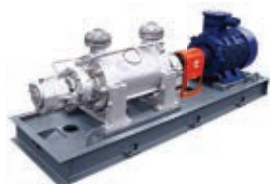
API 610 standard pumps