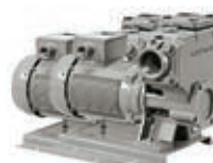
Cascade self-priming pumps CS, CHS Series