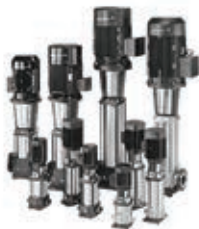
Vertical multi-stage pumps CR, CRN, CRE, CRNE Series