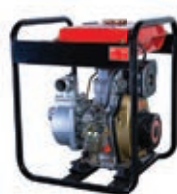
Diesel / Gasoline engine water pumps and Fire pumps