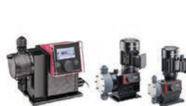
Dosing pumps and accessories DDA, DDC, DMH, DMX Series