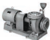
Centrifugal pumps F, G Series

Authorised dealer of quality pumps from the market leader in Japan