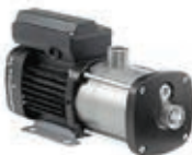
Horizontal multi-stage pumps CM, CME Series