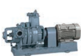
Horizontal multi-stage self-priming pumps TVS, KS Series