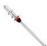
Pneumatic drum pumps (Aluminium / Stainless steel)