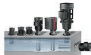
Immersible machine tool pumps MTA, MTD, MTH, MTR, MTRE, MTS, SPK Series

Authorised dealer of quality pumps from the market leader in Japan