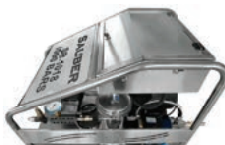
Electric ultra high pressure cleaners up to 2000 bars