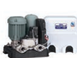
Domestic booster sets N, NF, NR Series