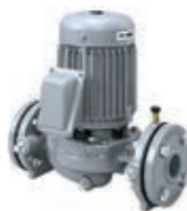
Vertical inline pumps P, PE, PSS Series